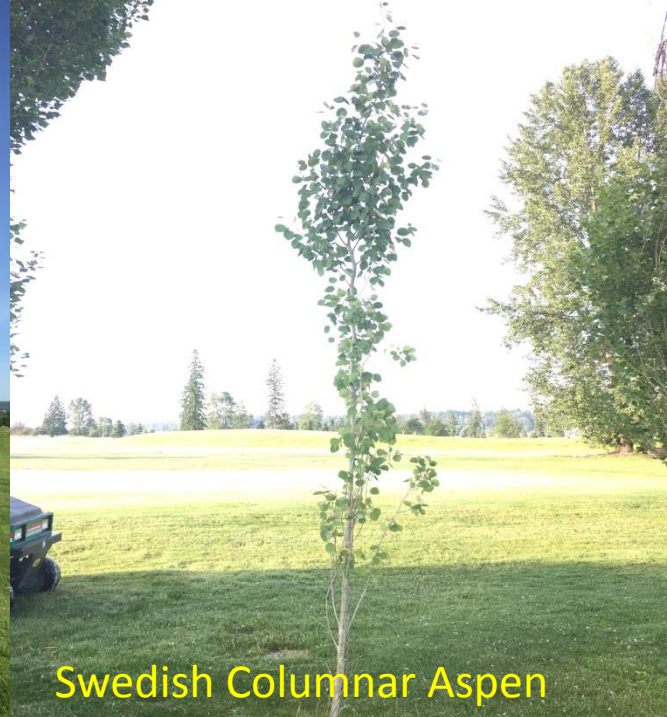
Swedish Columnar Aspen