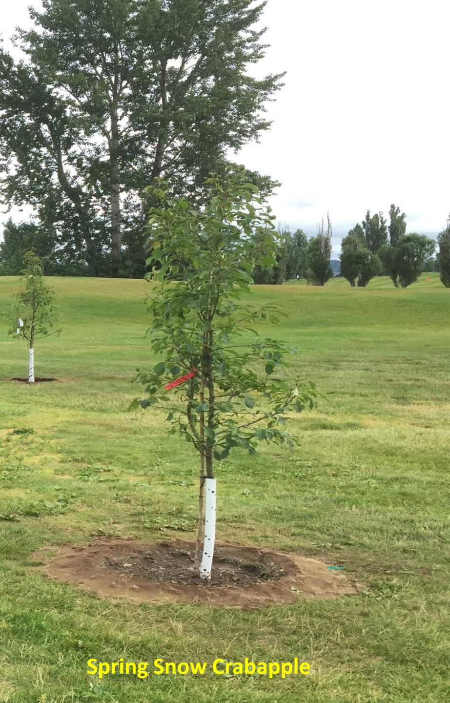
Spring Snow Crabapple