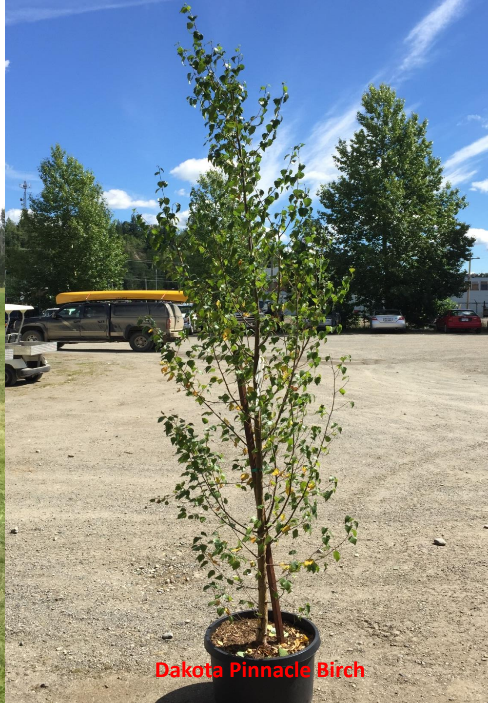
Dakota Pinnacle Birch