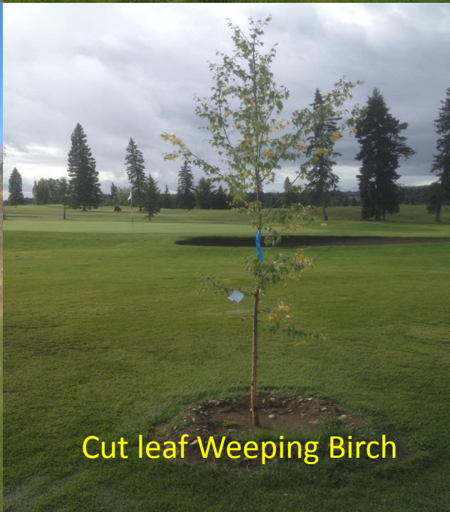
Cut leaf Weeping Birch